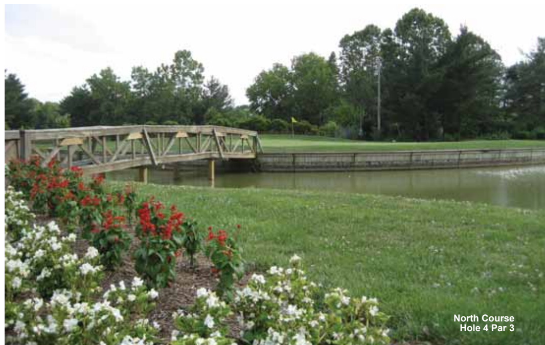
North Course Hole 4 Par 3

For more information visit bowlinggreencountryclub.net .