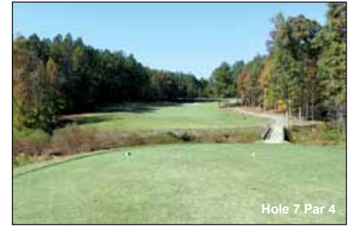
Hole 7 Par 4

Your tee shot is straight downhill, so let the big dog eat. Jacobson's creative design allows the par 3 fourteenth to play anywhere from 140 to more than 220 yards. He leaves plenty of room to the left on this hole as a bailout area. Unlike any other hole at Augustine,