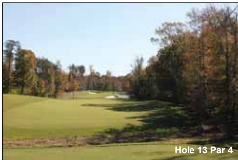
Hole 13 Par 4

fifteen is a short (305 yards from the tips) par 4 that plays uphill all the way. Your approach needs to carry over to the sand bunkers that guard the right front of one of Augustine's most narrow greens. Sixteen wraps up the signature par 4s with a spectacular elevated tee shot. This hole is so natural it looks like all they did was stick a flag in the ground and say "go for it."