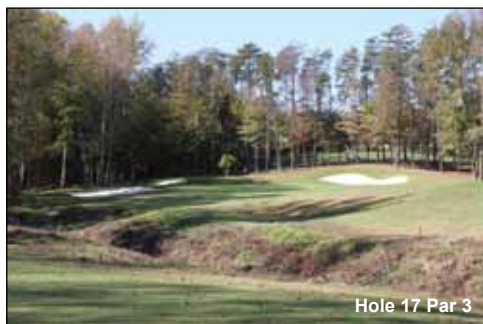
Hole 17 Par 3

Raspberry Golf Management's addition of Augustine Golf Club to their golf course portfolio gives the team four of Northern Virginia's premier facilities under one umbrella. They join sister properties Bull Run Golf Club in Haymarket, Old Hickory Golf Club in Woodbridge, and Raspberry Falls Golf & Hunt Club in Leesburg to form one of the strongest foursomes in area golf. RGM also manages the blossoming Raspberry Golf Trail that includes these four along with several of the mid-Atlantic's most recognized golf facilities including Blue Ridge Shadows in Front Royal, VA, Cannon Ridge in Fredericksburg, VA, and Penn National in Mont Alto, PA, and Royal Manchester in York, PA. The full resurrection of Augustine Golf Club can only benefit by standing side by side with these solid properties. As a golfer, I'm just ecstatic to see one of the best courses in the region rescued from the doldrums of lackluster ownership and hard economic times. You just can't keep a good course down.