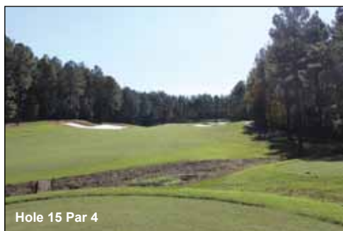
Hole 15 Par 4

Choose your club wisely on the par 3 seventeenth, which plays to a deep undulating green surrounded by three sand traps. To put a cap on this marvelous layout, the par 5 eighteenth (pictured on the cover) is a gorgeous risk-reward hole. If you pop a good drive between the fairway bunkers, you can get home in two. The green is set brilliantly adjacent to the splendid lodge clubhouse,