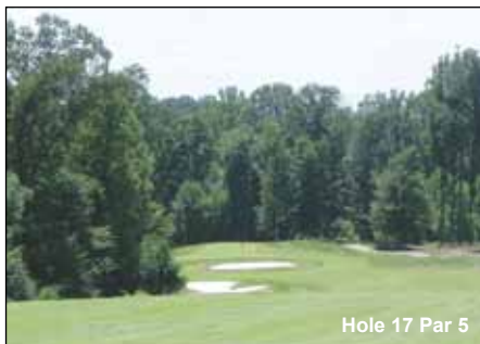
Hole 17 Par 5

The back nine at The Woodlands opens with a short par 3 that plays to a crowned green surrounded by deep sand traps. The toughest stretch of holes is easily eleven thru thirteen. The first two are pars 4's that play around a couple of large ponds. Add some serious length issues and you have a pair of brutes. The par 5 that follows almost plays like a double dogleg and is the longest hole at The Woodlands spanning nearly 600 yards from the tips. After that rugged