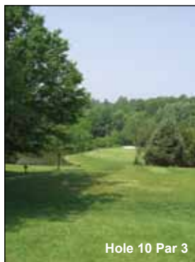
Hole 10 Par 3

target golf shots because the hole is dissected by a creek. The 383-yard fourth is rated the hardest hole at Meadowcreek with a hazard down the left side and an uphill second shot. To testify just how tough the par 3's are here, three of the five are rated the seventh, ninth, and tenth most difficult holes. That's a rarity in most conventional golf course layouts. The first of the strong set is number six, which plays longer than the publicized 171 yards because it's straight uphill. Shots that fall just short have a chance to roll back down to the fairway. The par 4 seventh is noted for its beauty with views of the Rivanna River and Pantops Mountain prevalent from the elevated fairway. That river and a large pond make the par 3 eighth one of the toughest in Albemarle County. The front nine closes with a flowing par 4 that also plays slightly uphill. Hmmmm. Seems like we have a theme here. One of the challenges that makes Meadowcreek such a good test of golf is that many approach shots are played uphill. So, club selection is crucial.