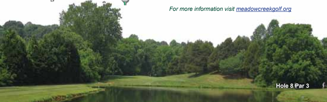
Hole 8 Par 3

For more information visit meadowcreekgolf.org