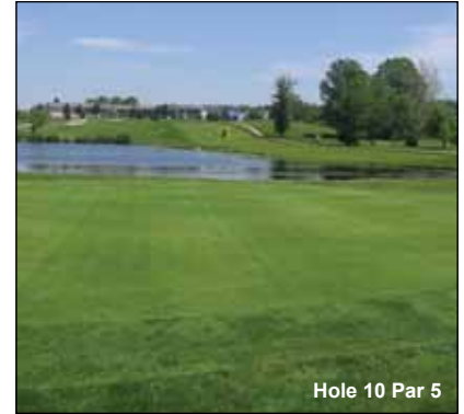
Hole 10 Par 5

3 third has an unmistakable resemblance to the twelfth hole at Augusta National. Instead of Rae's Creek, here it's Tom's Creek! This pesky water hazard meanders its way throughout, and it's literally a golf ball magnet. The 584-yard par 5 fourth is the longest hole on the course and requires a forced carry over the creek to the green. The ninth is also a par 5, with a pivotal dogleg right over and around a large lake. To add to this difficult hole, it's uphill after the tee shot playing to a green perched between bunkers at the top of the property. It's also a great hole to view the Liberty Mountain slopes in the background.