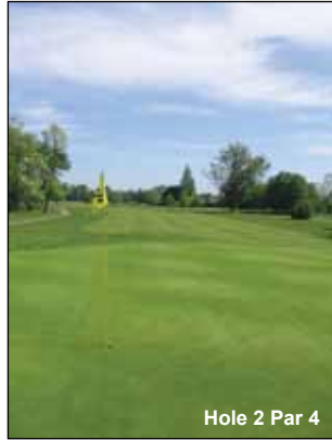
Hole 2 Par 4

The golf course is one of the few you will ever find with this unusual combination of holes. At Carroll Valley, you'll encounter six par 3's, and five par 5's, along with the remaining par 4's to complete the par 71 layout. Stretching from nearly 6700 yards from the blue tees to a very woman-friendly 5000 yards from the red tees, this rare collection of holes gives you more scoring opportunities than the traditional course breakdown. The ladies will also enjoy an additional par 5 in the mix giving them a par 72. Having taken several golf groups to this facility, it's easy for me to state that this course is favorable to most women golfers.