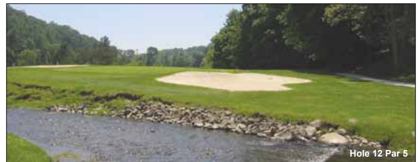
Hole 12 Par 5

For more information visit carrollvalley.com