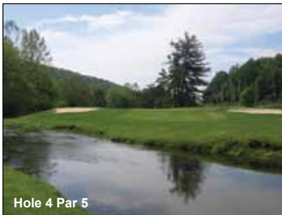
Hole 4 Par 5

The golf course is one of the few you will ever find with this unusual combination of holes. At Carroll Valley, you'll encounter six par 3's, and five par 5's, along with the remaining par 4's to complete the par 71 layout. Stretching from nearly 6700 yards from the blue tees to a very woman-friendly 5000 yards from the red tees, this rare collection of holes gives you more scoring opportunities than the traditional course breakdown. The ladies will also enjoy an additional par 5 in the mix giving them a par 72. Having taken several golf groups to this facility, it's easy for me to state that this course is favorable to most women golfers.